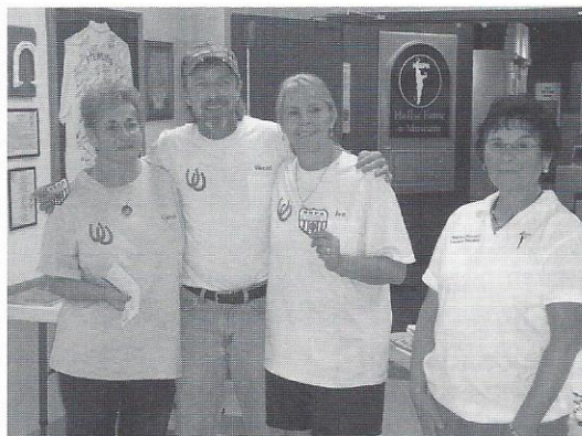
2011 National Champions

third getting $125 and fourth place taking home $110. The standings of the tournament are published in this issue of Newslines.